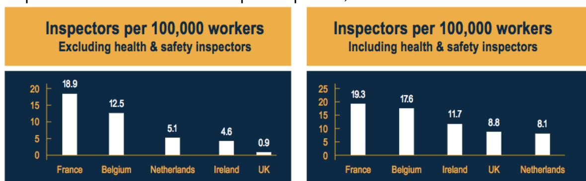
Graph I and II. Number of labour inspectors per 100,000 workers. 24